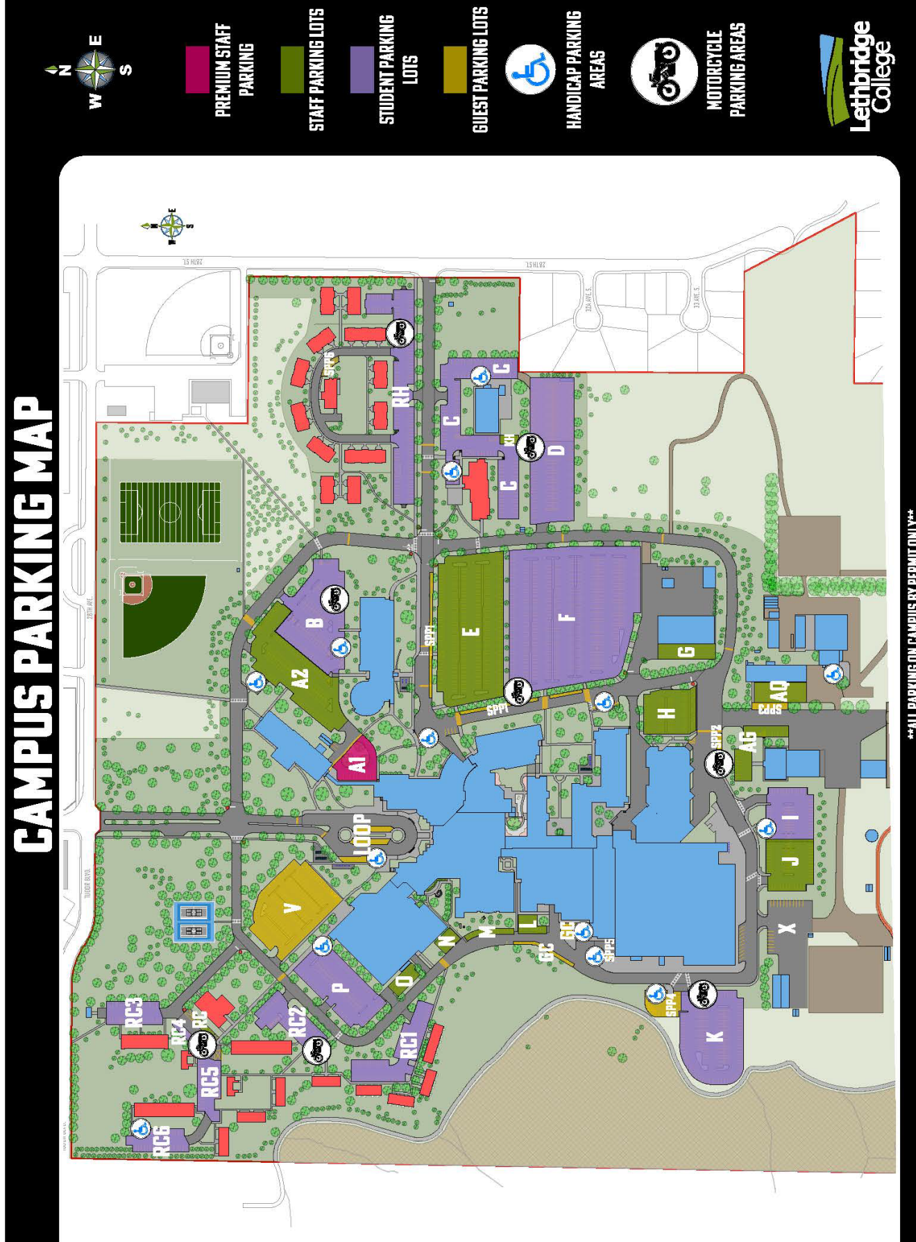
MOTORCYCLES ARE REQUIRED TO REGISTER WITH PARKING SERVICES IN CE2201. PROOF OF A VALID LETHBRIDGE COLLEGE PARKING PERMIT REQUIRED. HANDICAP PARKING REQUIRES A VALID LETHBRIDGE COLLEGE PARKING PERMIT AS WELL AS A VALID HANDICAP PARKING PERMIT.